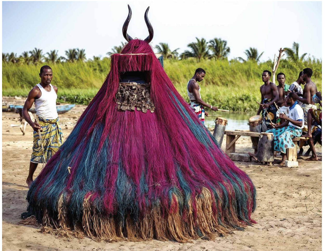
A Zangbeto at a voodoo celebration in Benin.

Day 1: Arrive in Accra (Welcome - Akwaaba) Arrive in Accra, Ghana. You will be met at the airport by Landtours representatives who will assist you with your transfer from the airport to your hotel. Enjoy a welcome drink at the hotel and participate in an orientation session. Dressmakers will take measurements and sew cloths for interested participants. Overnight at Lancaster Accra Hotel or Similar. Meals included: Dinner at the Hotel.