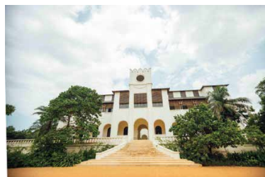
Palais de Lomé in Togo

Day 10: Ouidah After breakfast, check out and depart for a visit to Ouidah, the cradle of African Traditional Religion, en-route to Cotonou. Tour the temple