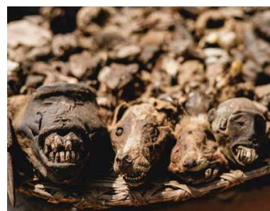
Animal skulls at the Voodoo Market

Day 11: Voodoo Festival After breakfast, depart your hotel and embark on a sensational visit to Ganvie (the village on water), commonly referred to as the Venice of West Africa. Witness first hand, the people of Ganvie carrying out their daily routine as vendors in dugout canoes pile high with wares, transacting commerce with one another and with tourists. You will enjoy shopping on the floating market and taking a relaxing canoe ride on the waterways of this exotic 300-year-old village.